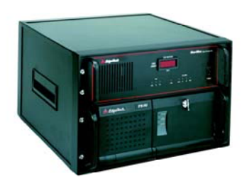
EdgeTech Model 2000 Topside Processor